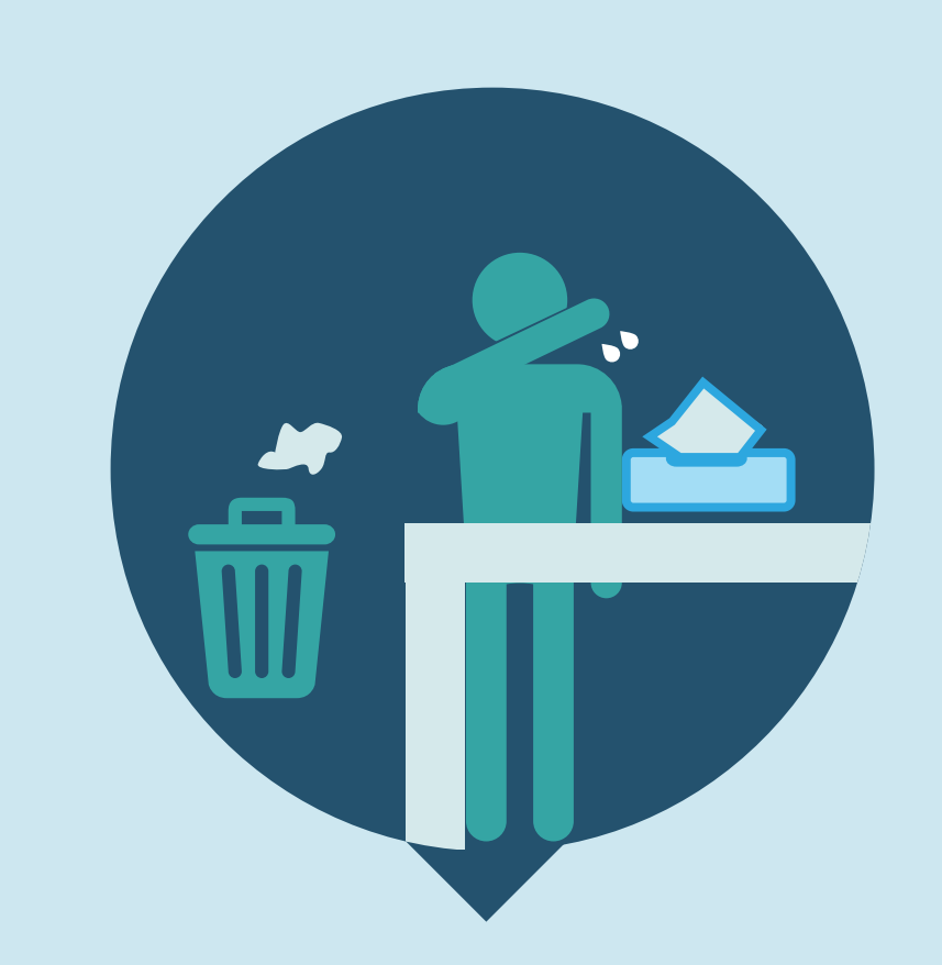
Use tissue when coughing and throw it away in the trash