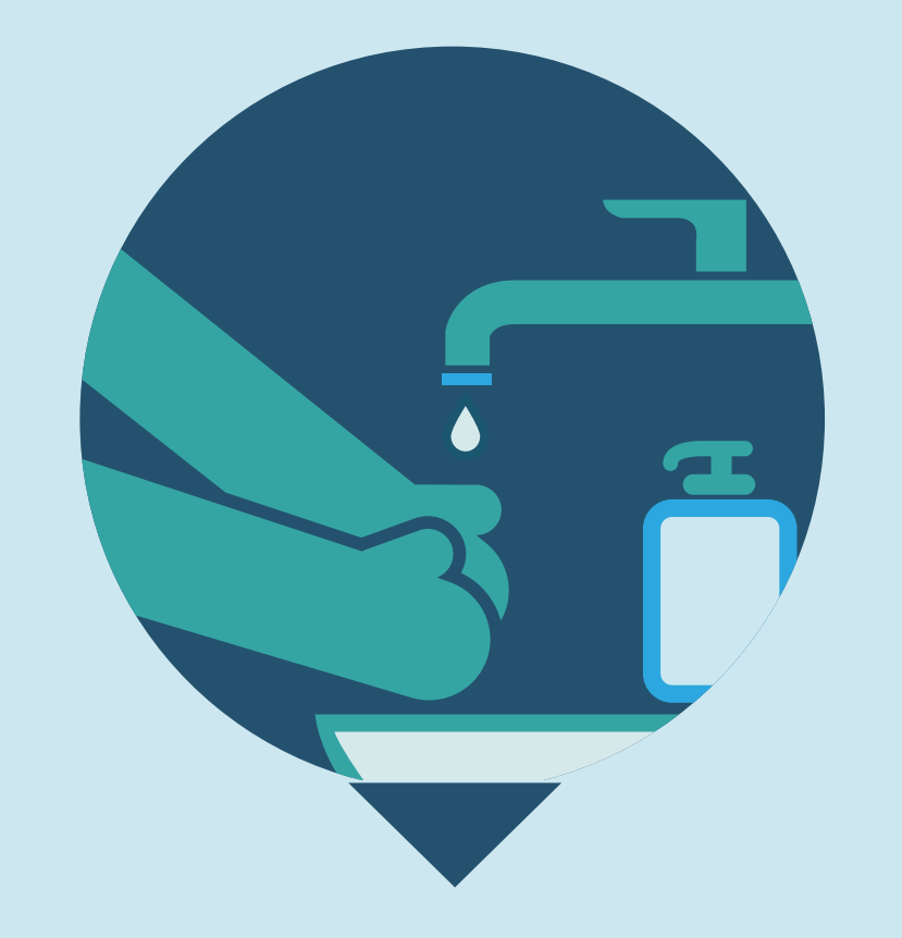
Wash hands with soap and water or use an alcohol-based hand cleaner